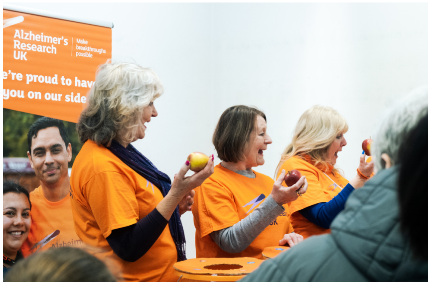
Alzheimer's Research UK with 'The Human Fruit Machine'